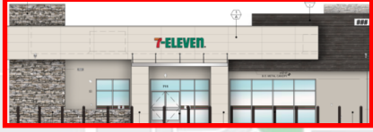
7/11 with Carwash