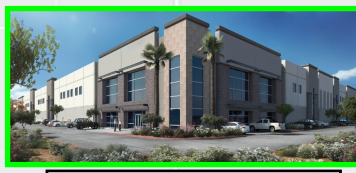
426,000 square feet of industrial warehouse