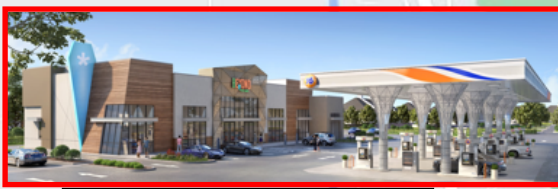
Beyond Food Fueling Station