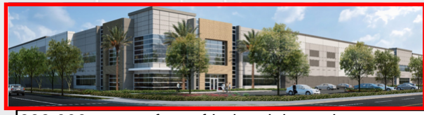
338,000 square feet of industrial warehouse