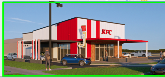
KFC and Little Ceasars in Spectrum Shopping Center