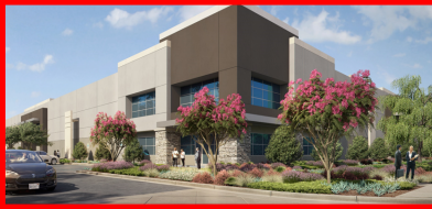
205,000 square feet of industrial warehouse