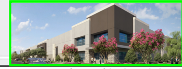
303,000 square feet of industrial warehouse