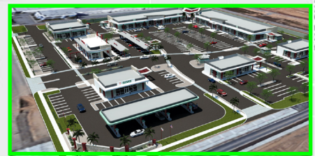
March Plaza & 7/11