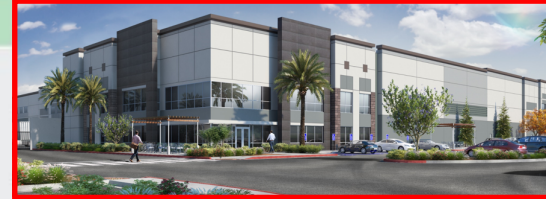
1.3 million square feet of industrial warehouses