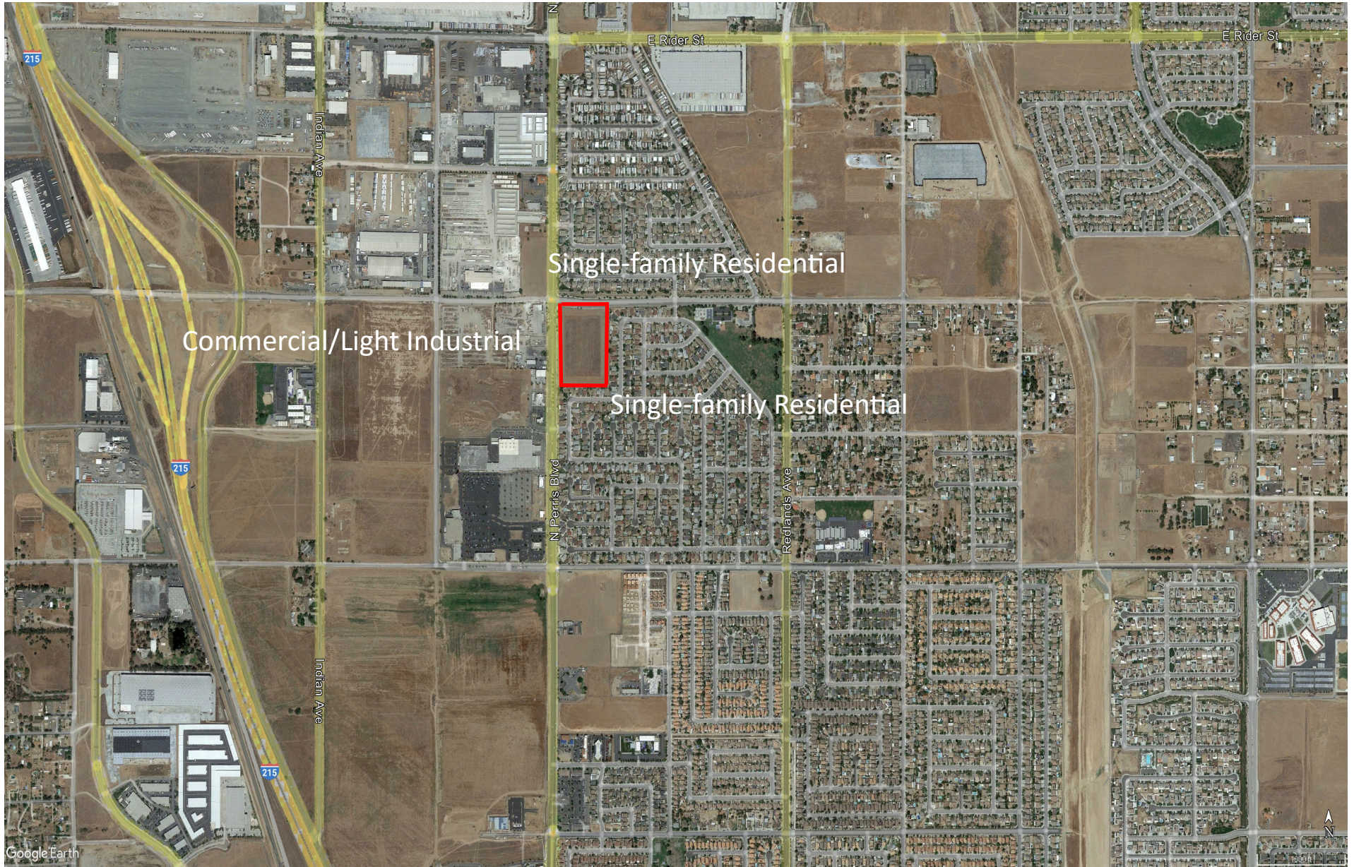
Figure 1—Vicinity Map