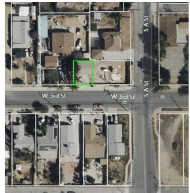
3 rd Street Water Booster Station (Entire) APN: 313050033 Size: 2,175 SF