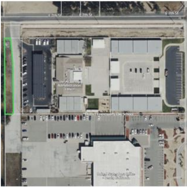
7 th Street Lift Station (Portion) APN: 310160055 Size: 8,298 SF

© 2011 Google Earth - All rights reserved. Imagery provided by Google.