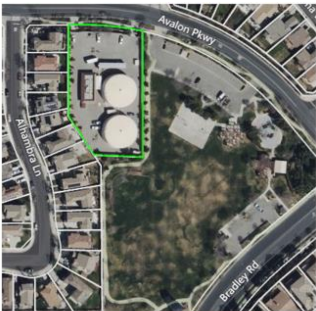
North System Reservoir Site (Entire) 1600 Avalon Parkway, Perris, CA 92571 APN: 303370003 Size: 44,431 SF