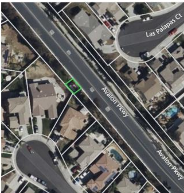
North System Well No. 4 (Portion) APN: 308323058 Size: 555 SF