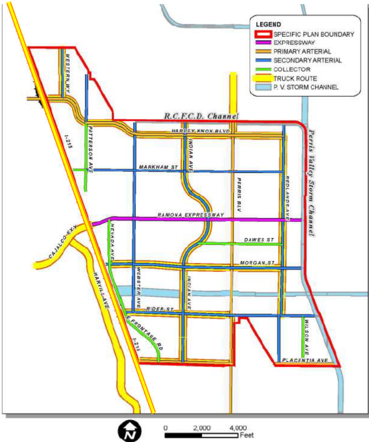
Figure 3.0-3, Truck Route Plan